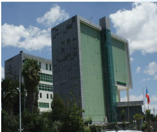
Equatorial Guniue Embassy