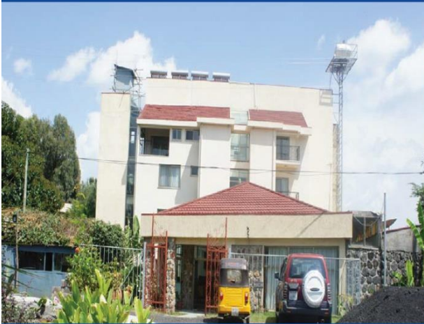
Babogaya Resort (Bishoftu)