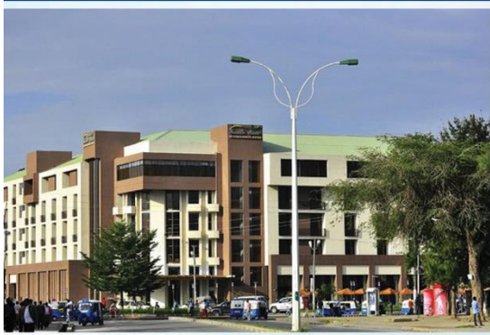
South Star Hotel (Hawasa)