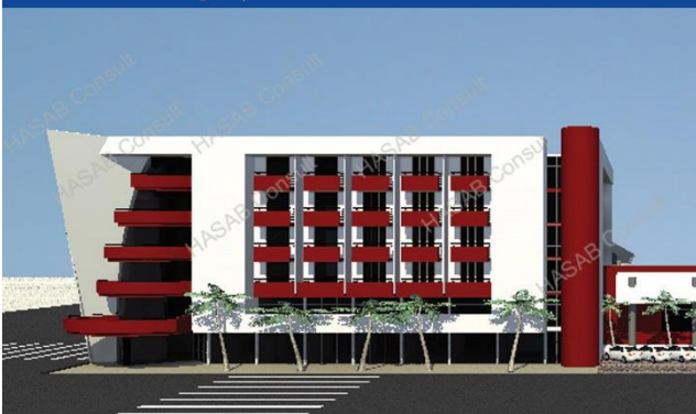
Rori Hotel (Hawassa)