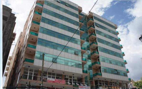
Garad Building (Bole)