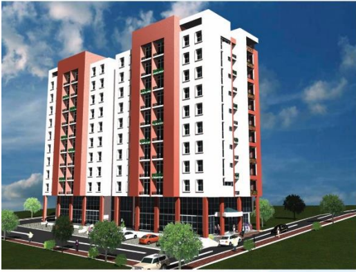
AZ Real Estate (Piassa)

Reliable Product Innovation Technology Competitive Cost Humanized Design