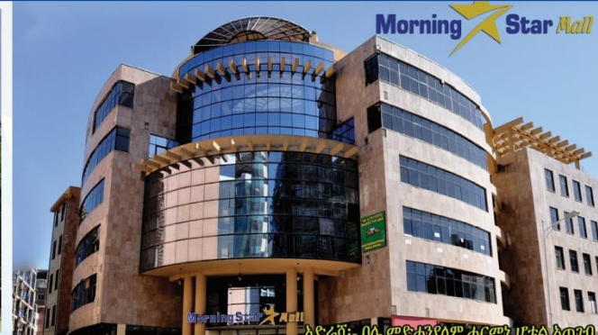
Morning Star Mall