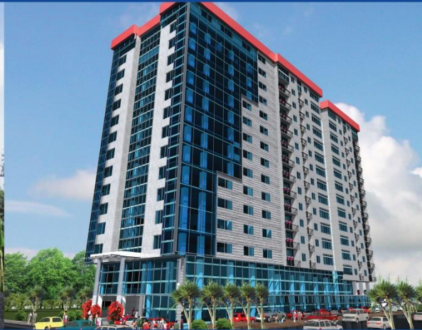
Asier Real Estate